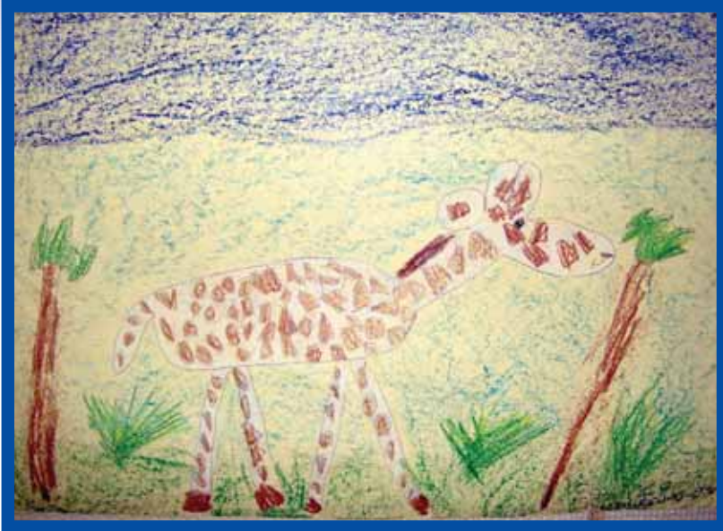
Artwork by Essence Chandler, First Street Elementary School